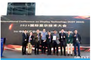
CDIA Award Ceremony