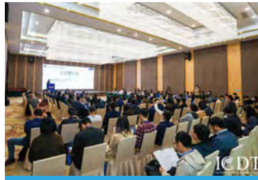
Display Industry Future Technology Strategy Summit(FTS)