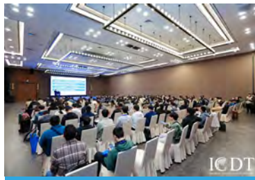
Micro/Mini LED Display Core Technology Road Map Forum