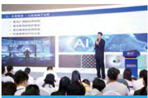
Roadshow of Innovation and Entrepreneurship Projects