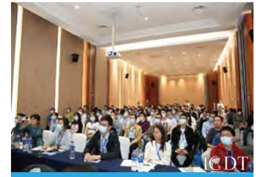
Short Course / Seminar

ICDT is an excellent venue to exchange ideas between display professionals and to establish collaboration with a broad spectrum of researchers and key industry players around the world. The first ICDT was successfully held in Fuzhou in 2017 followed by ICDT 2018 in Guangzhou, ICDT 2019 in Kunshan, ICDT 2020 in Wuhan, ICDT 2021 in Beijing, ICDT 2022 in Fuzhou and ICDT 2023 in Nanjing with higher level, larger scale, and stronger international influence.