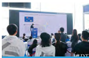
New Technology & New Product Launch Event